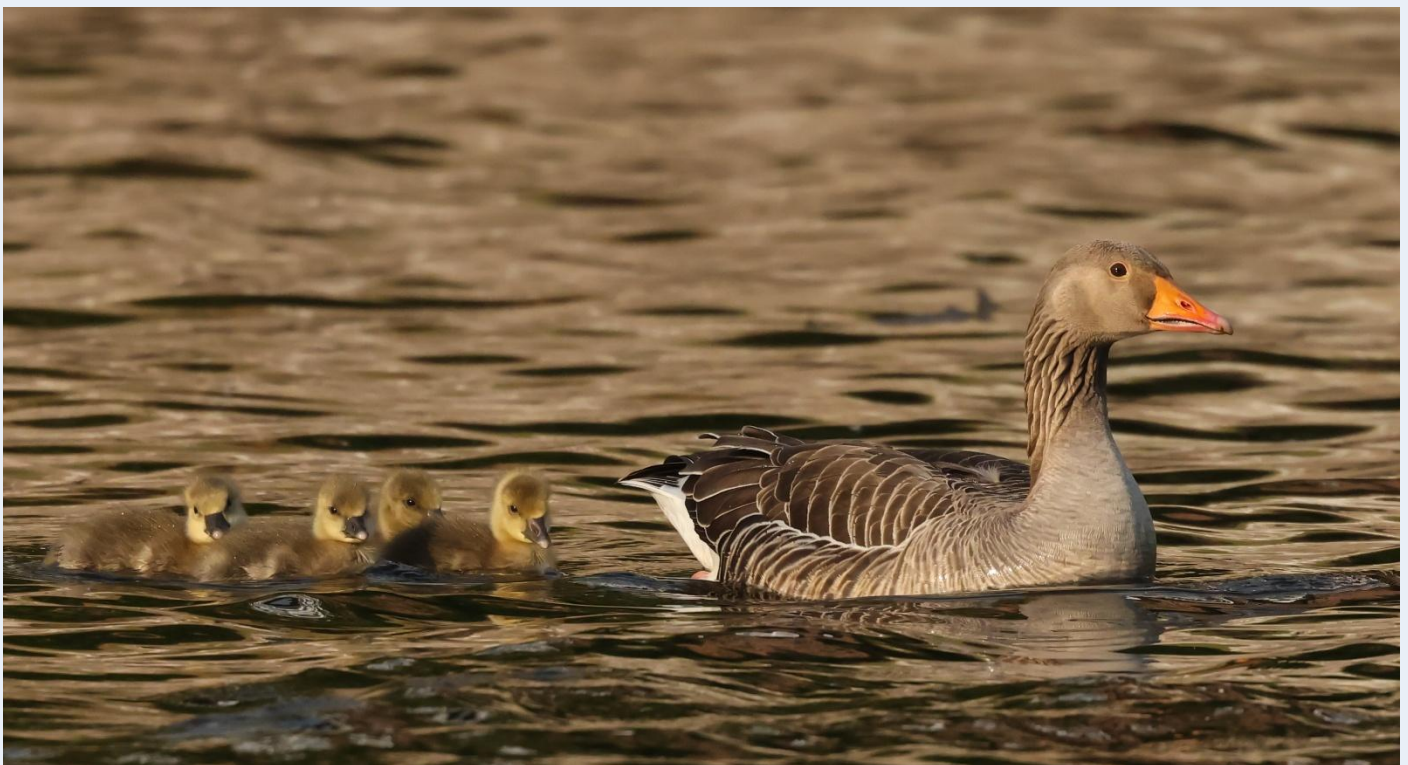
A Greylag goose and her goslings – see Meadows Log 7 th May