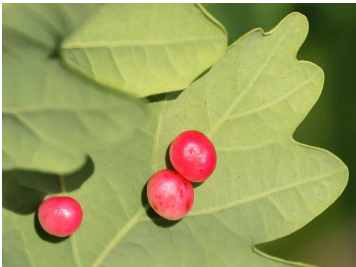
Smooth Pea Gall (see 19th June)

The Dog-rose plant is usually the host for Smooth Pea Galls (Cynipid wasp). However, a dozen of these bright pink Galls were found on Oak leaves below Andrew Crescent. (see pic).