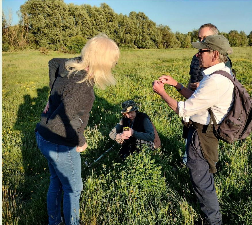
Participants on the botany walk in May

Further walks are taking place on 20th August and 17th September meeting at the entrance to Bottoms Lane to start walking and plant life spotting at 6.30pm. All welcome.