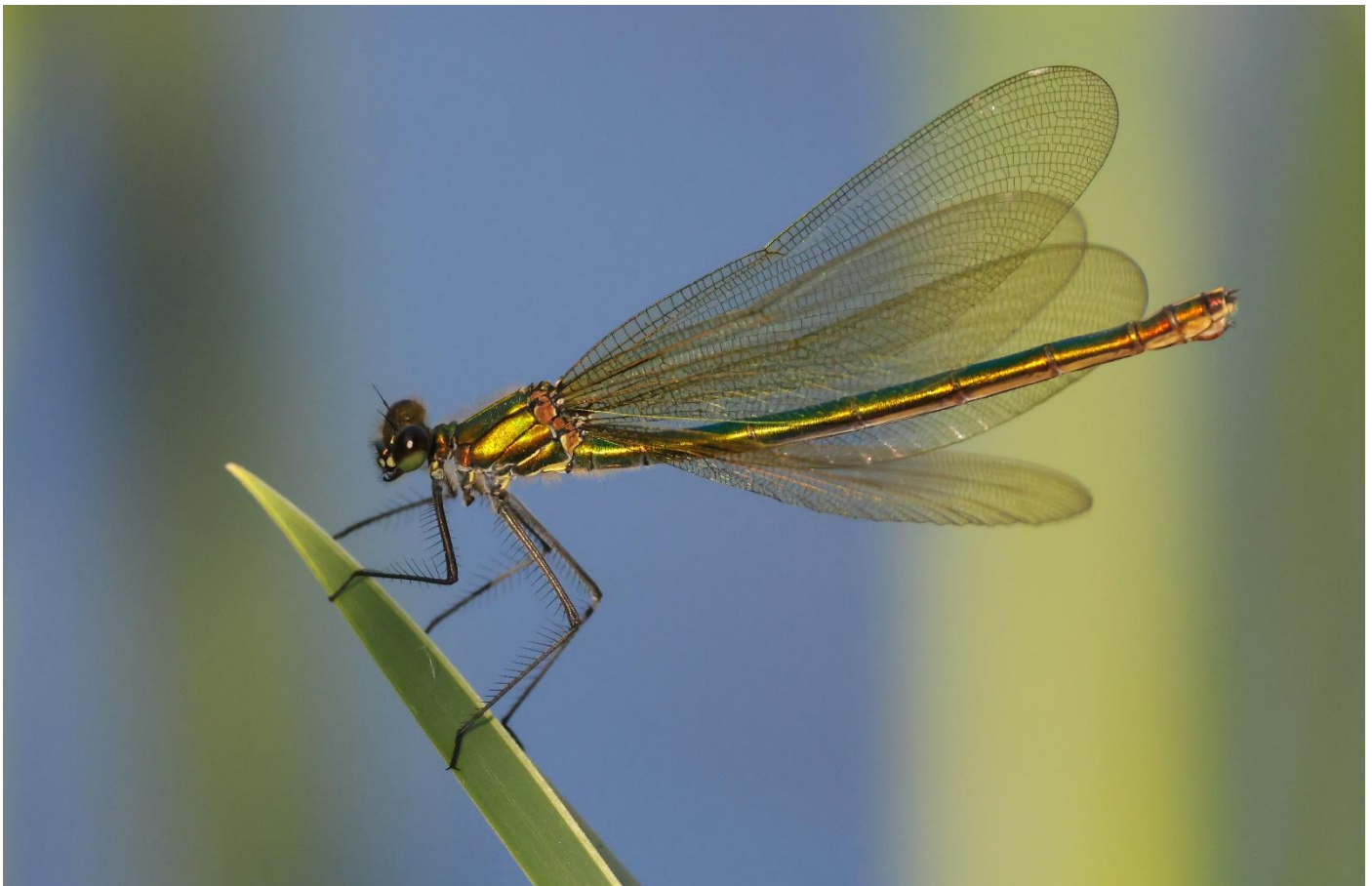
Banded demoiselle (see Meadows Log 19th June)