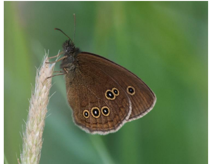
Ringlet (see 19th June)

In the riverside vegetation there were good numbers of Banded Demoiselle