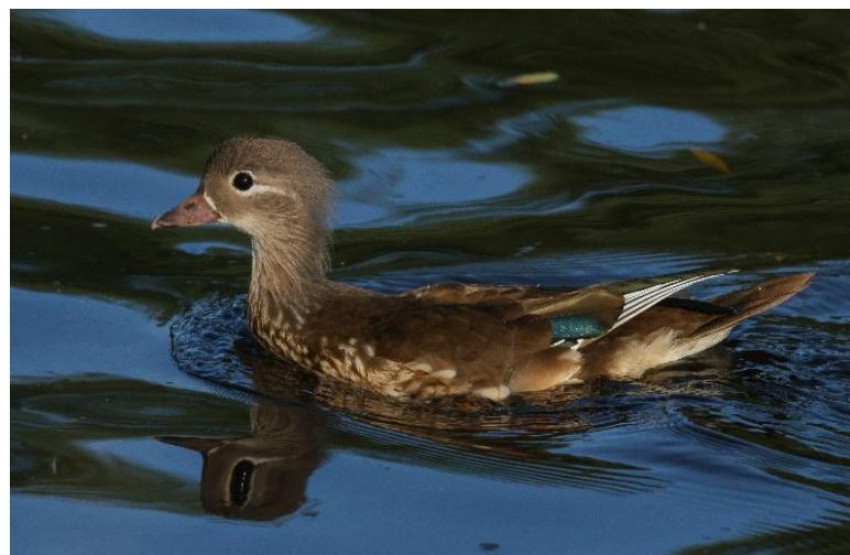
Female Mandarin (see 16th June)