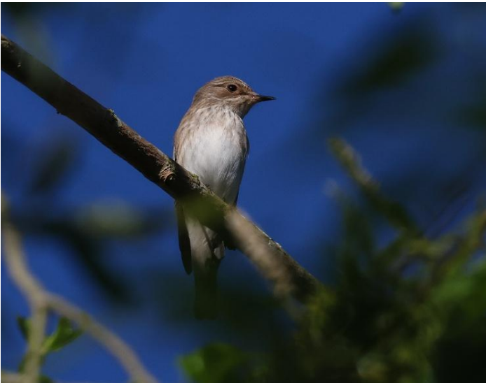
Spotted flycatcher (see 13th May)